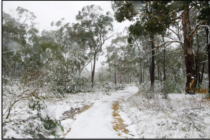
The morning of 17 th July 2015: Remarkable falls cover the Granite Belt