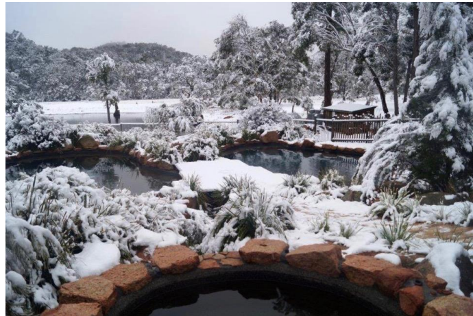
On the morning of 17 th July 2015: Remarkable falls covered the Granite Belt